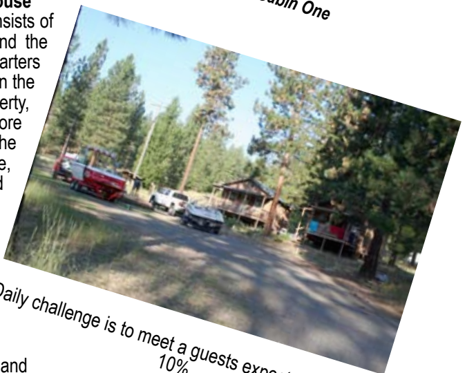
Daily challenge is to meet a guests expectations plus 10%