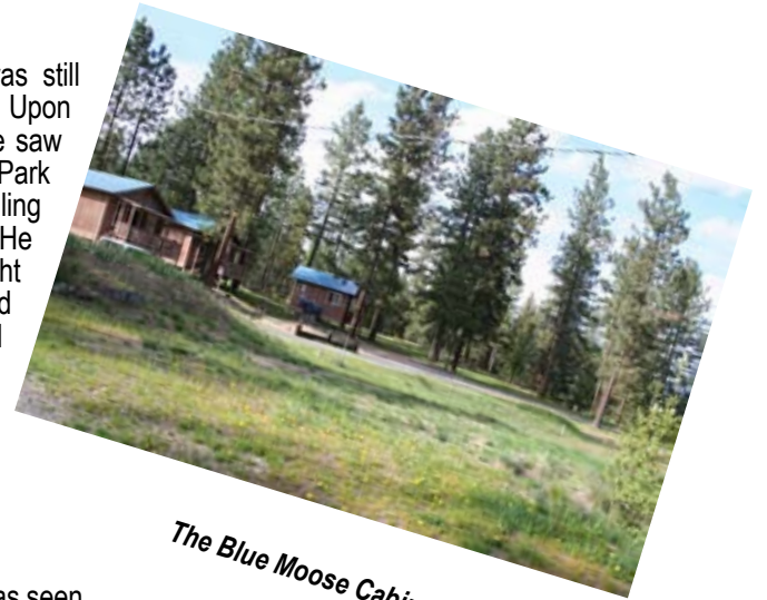
The Blue Moose Cabins

The Blue Moose Cabins have become quite popular with family reunions. They are already booked for a few this summer. There is ample room for these gathering families to set up tables, tents, chairs and whatever they need to have a great time. For the hunters, the back porch off the office has become a convenient, sheltered place for bagged deer to be hung. Bull hopes to have a better hanging shed built soon that would be completely enclosed.