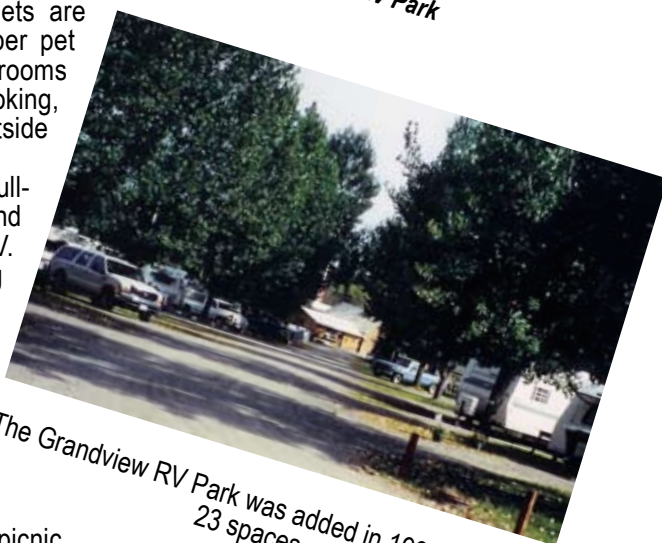
The Grandview RV Park was added in 1990 and has 23 spaces.