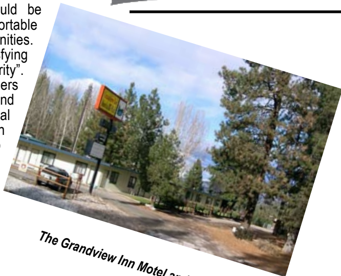
The Grandview Inn Motel and RV Park

For more information on the workshop see the article at the bottom of page 3.