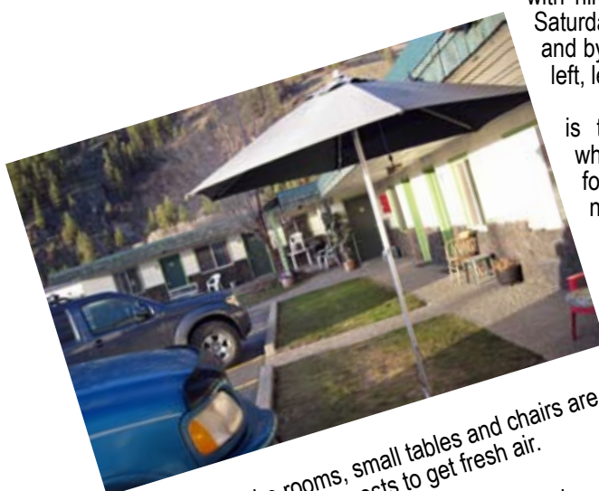
Outside of the rooms, small tables and chairs are provided for guests to get fresh air.