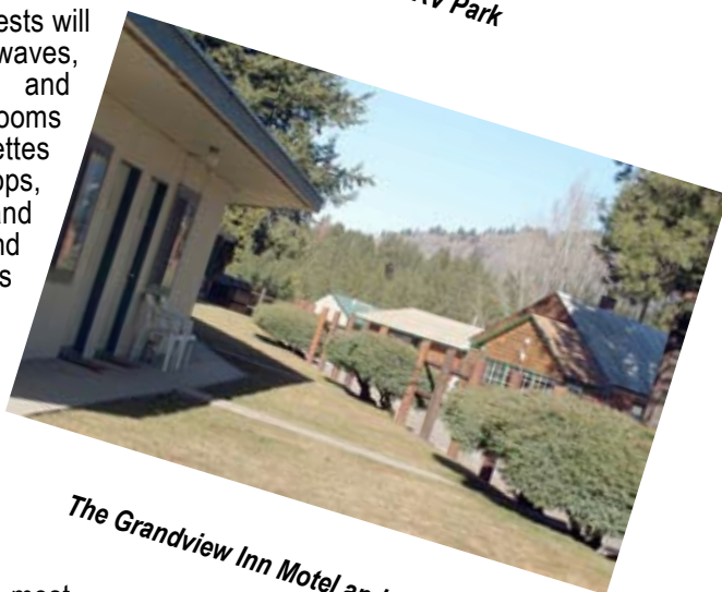
The Grandview Inn Motel and RV Park