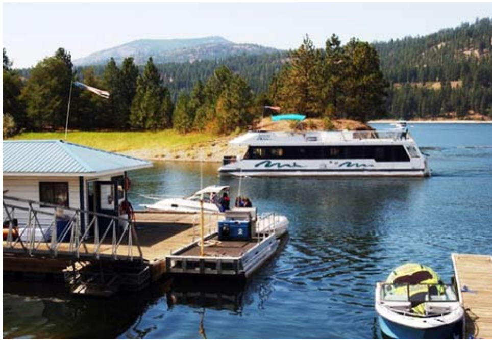
Kettle Falls Marina with one of the houseboats coming in to the dock.

featured a store, a gas pump, three boats and 8-10 docks that were used by the Upper Columbia Boat Club. Since the Wimberly's have taken over they have built up a fleet of 16 houseboats and added moorage. All houseboats sleep up to 13 people and some have hot tubs; kayaks, water skis and tubes are available. The Wimberly's estimate that there will be 225 houseboat trips purchased this summer. The updated store features a deli, grocery items, beer and wine, ice, fishing tackle and some souvenir clothing. They sell marine gas and propane, and are the only vendors who sell fishing licenses in Kettle Falls.